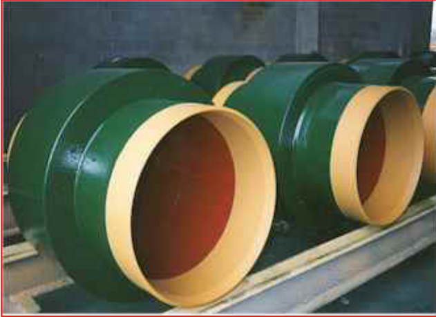
阴极保护用整体式绝缘接头 Monolithic Isolating Joints