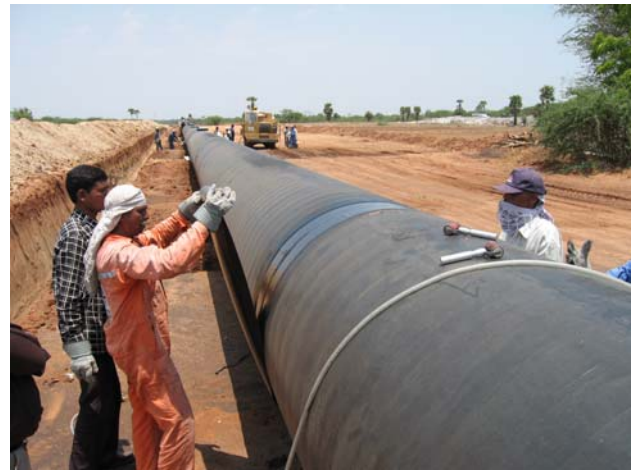
印度东气西输管道工程防腐补口 India East to West Gas Pipeline Joint Coating