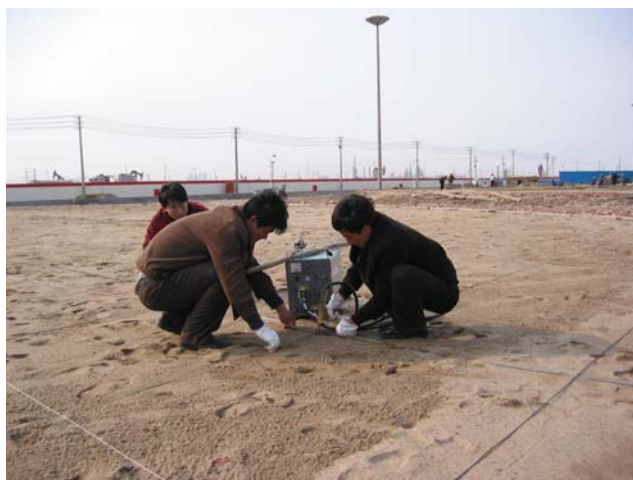
储罐阴极保护网状阳极系统安装 MMO Grid System for Tank Bottom CP