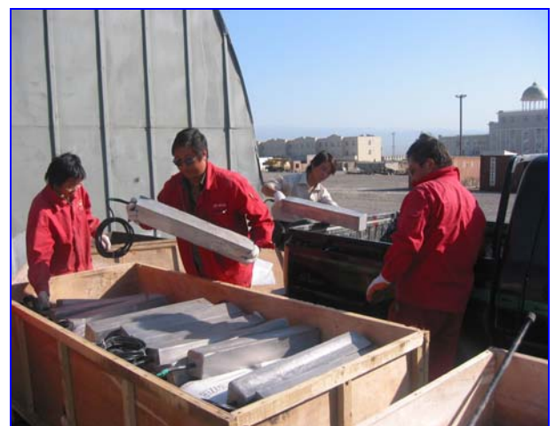
牺牲阳极阴极保护系统安装 Galvanic Cathodic Protection System Installation