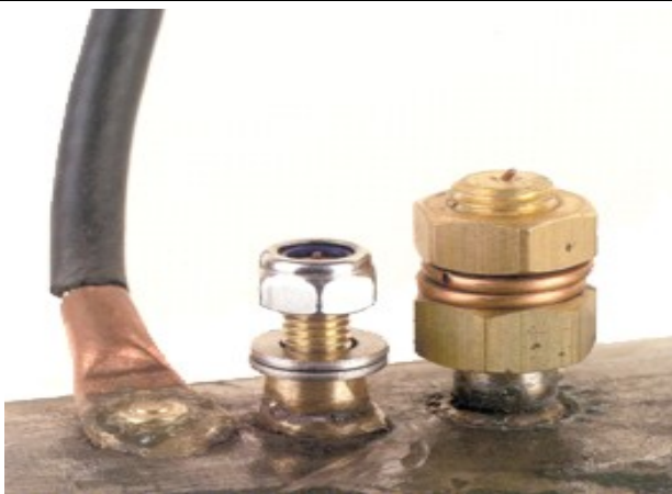
测试电缆连接用铜焊机、焊钉 Pin Brazing Unit and Pins