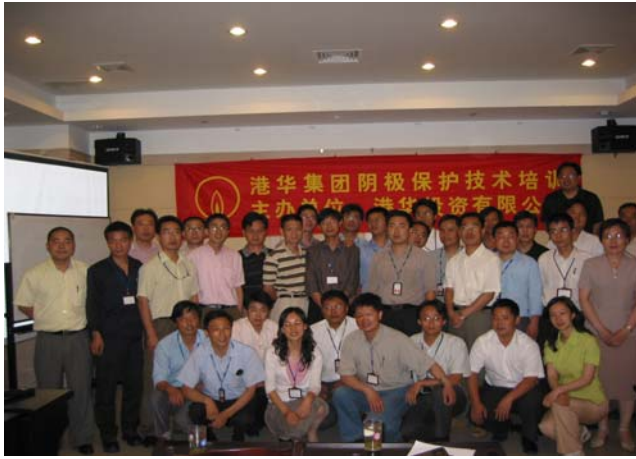
港华燃气集团阴极保护培训 Town Gas Hong Kong CP Training