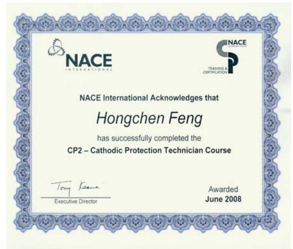
美国防腐蚀工程师协会 2 级证