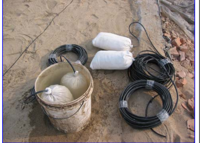
长效硫酸铜参比电极 Permanent Cu/CuSO 4 Reference Cell