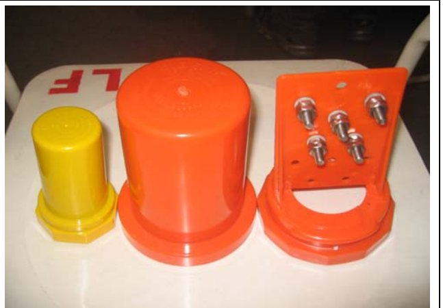
塑料测试桩接线帽 Test Station Head