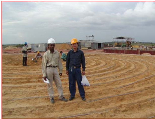
斯里兰卡罐区阴极保护安装指导 Srilanka Tank Farm CP Installation Supervision