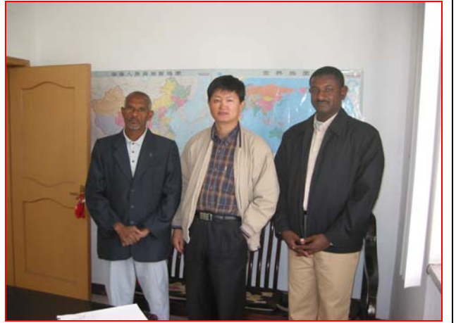
苏丹大尼罗河石油公司防腐工程师培训 Sudan Great Nile Petroleum Co. CP Training